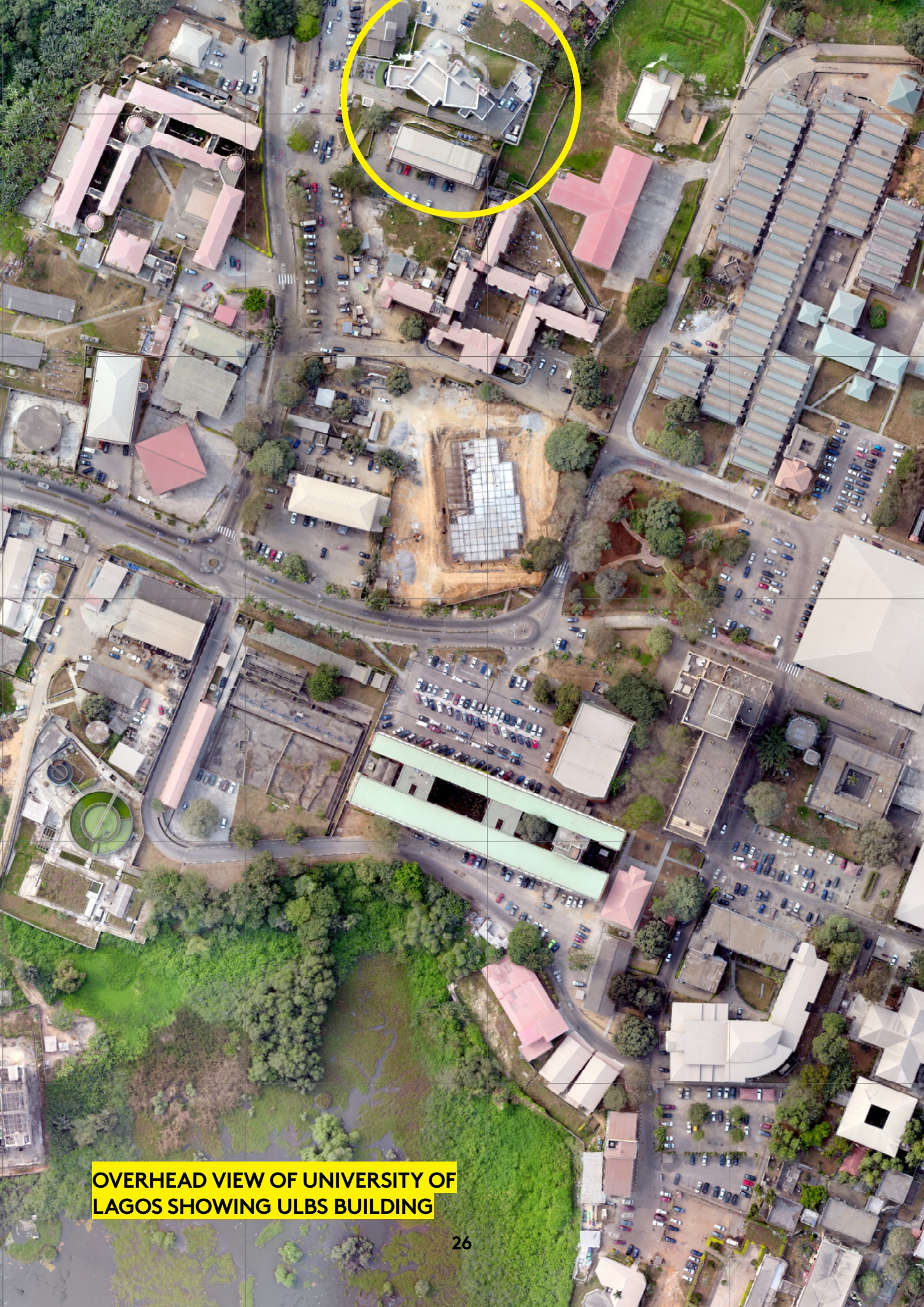
OVERHEAD VIEW OF UNIVERSITY OF LAGOS SHOWING ULBS BUILDING